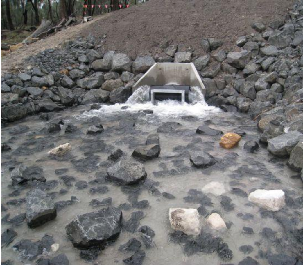
Figure 1 - TWTF Discharge Location

To ensure the safety and reliability of the treated CSG water entering the river, Australia Pacific LNG is engaged in a comprehensive ongoing monitoring program of water quality sampling, testing and reporting. This report summarises the results of that monitoring conducted during the third quarter (i.e. from 1 July to 30 September) of 2013.